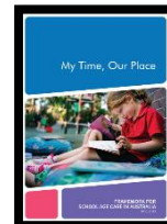
My Time, Our Place; Framework for School Age Care in Australia 2022 V2

Critical reflection: is a meaning-making process that assists informing future practice in ways that demonstrate an understanding of each child’s learning, development and wellbeing and implications for equity and social justice. It involves examining and analysing events, experiences and practices from a range of perspectives to inform future planning and decision-making ( Early Years Learning Framework 2022 V2 – refer to Sources ).