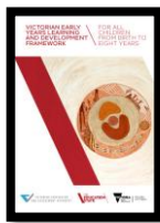
Victorian Early Years Learning and Development Framework

Approved learning framework: a guide which provides a vision for learning, pedagogical principles, practices and general goals or outcomes for children’s learning and how they might be attained. It provides a scaffold to assist educators to develop their own, more detailed curriculum relevant to their setting and the children and families attending. The Early Years Learning Framework V2 (Belonging, Being & Becoming) , the Victorian Early Years Learning and Development Framework and My Time, Our Place V2; Framework for School Age Care in Australia are approved learning frameworks for use in Victoria ( refer to Sources ).